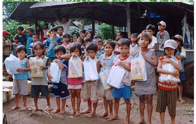
Students receiving books and uniforms

This past summer members from both the Scholarship Program and our partner organization in Vietnam, Greenbridge (Nhiep Cau Xanh), worked hard to implement Group B Scholarship Program for the 2004-2005 academic year. The objective of Group B Scholarship program is to support students who are living in poverty, but are still determined to work hard and succeed in their education. Through Group B, VietHope has supported 80 students from Binh Gia, Vung Tau. These 80 students are from an ethnic minority group called Chau-Ro. As Group B scholarship recipients, they received books and uniforms. In addition to these items, the fund covered for tuition for children in the primary level. Without the program's financial support, the students will unlikely receive the opportunity to access higher level of education.