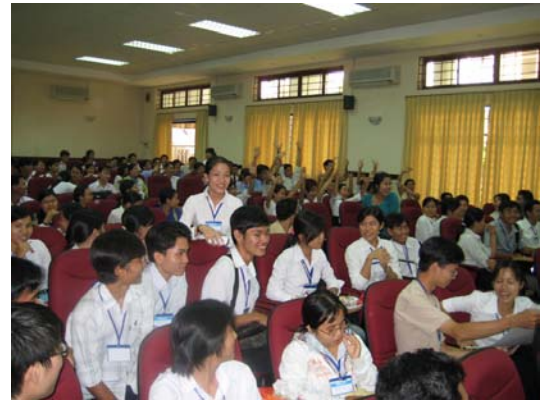
Student participation during the USP award ceremony in Ho Chi Minh City, January 2008

(scores of 20+ points) and in high school (GPA of 7.0+).