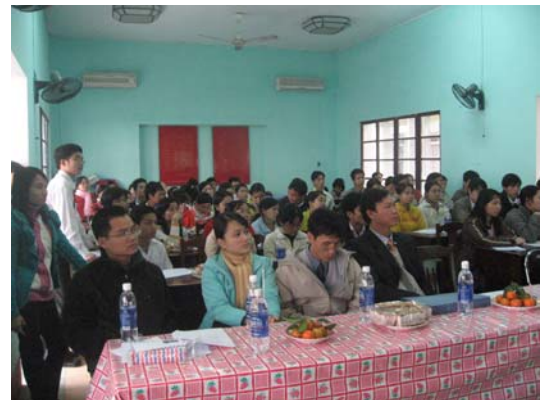
USP award ceremony in Hue, January 2008