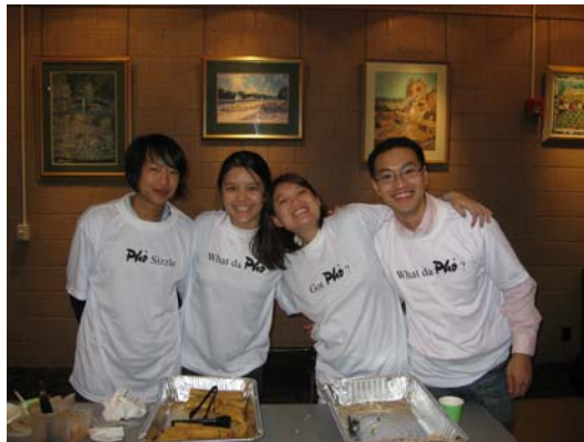
Johns Hopkins Spring Tonic Event, February 2008