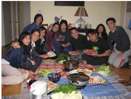
VietHopers enjoying a potluck at the Washington D.C. Annual Retreat, February 2008