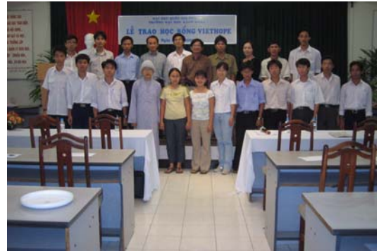
2005-06 VietHope University Scholarship Recipients Awards Ceremony

this program as well as other VietHope projects that aim to improve access to education for poor students in Vietnam.